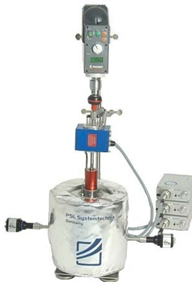
GHA 350 - with overhead stirrer