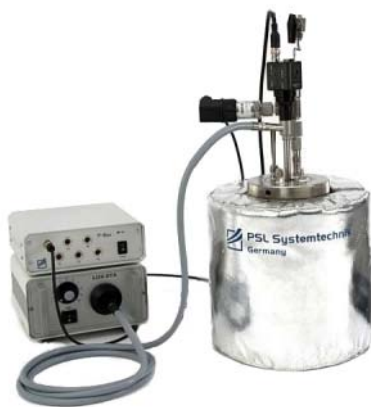
Gas Hydrate Autoclave GHA 200

Photos and videos can be taken during tests.