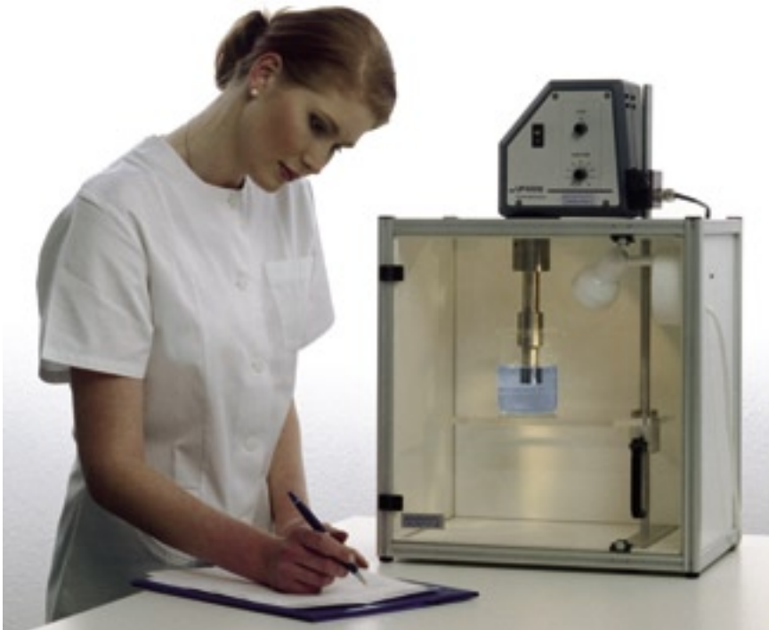
UP400S with H22 in sound protection box

The ultrasonic processor UP400S (400 watts, 24kHz) is our most powerful laboratory device. With sonotrodes of a diameter range from 3 to 40mm the device is suited for sample volumes from 5 to 2000ml. In flow approx. 10 to 50 liters per hour can be treated. For the preparation of test portions the UP400S is mainly used for bigger volumes. It is suited for the practical process development in the laboratory but also in the college of technology as well as for the production of small quantities. For production quantities a PC-control or a connecting lead to a central control of the user's plant is recommended in order to raise the process safety. With special flow cells and flange connections liquids can also be sonicated at high temperatures and pressures.