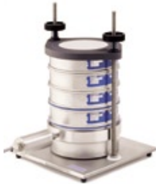
ultrasonic sieving in the laboratory