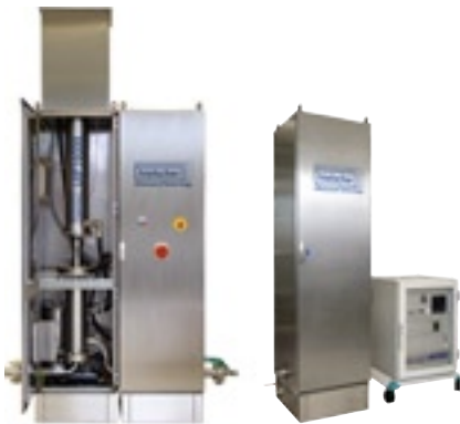
ultrasonic dispersing systems