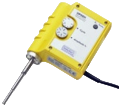
ultrasonic laboratory processors