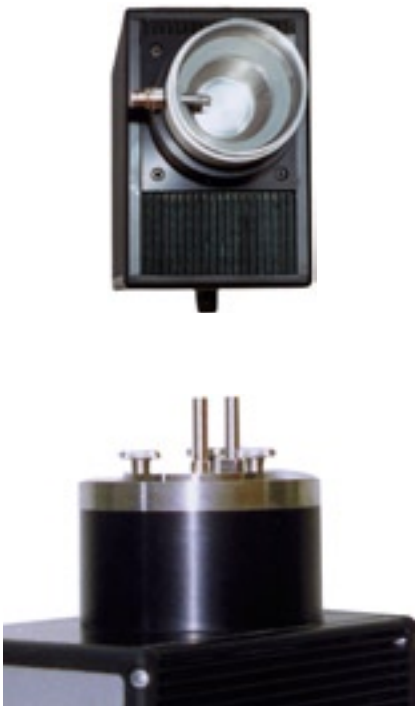
UTR200 as reactor chamber

The sonoreactor UTR200 (200 watts, 24kHz) works as an ultrasonic bath but at a 50 times higher intensity. In addition, it is dry-running protected. It is suited for the direct or indirect sonication of liquids e.g. for cell disruption, homogenizing or emulsifying. The beaker-shaped sonotrode is machined from one piece in order to prevent leakages. The upper part of the sonotrode is oscillation-free and can be used for mounting the respective accessories for diverse application cases. A corresponding reactor cover takes the Eppendorf tubes or test tubes for indirect sonication. By means of the reactor cover the chamber is hermetically sealed. If the cover has an additional inlet and outlet the sonoreactor can be used as a flow system. A sieving extension with a bajonet lock takes a pile of sieves for fine grain sizes (diameter 75mm, finest mesh size 5 micron). The ultrasound, which is transmitted to the sieves, accelerates the wet sieving process.