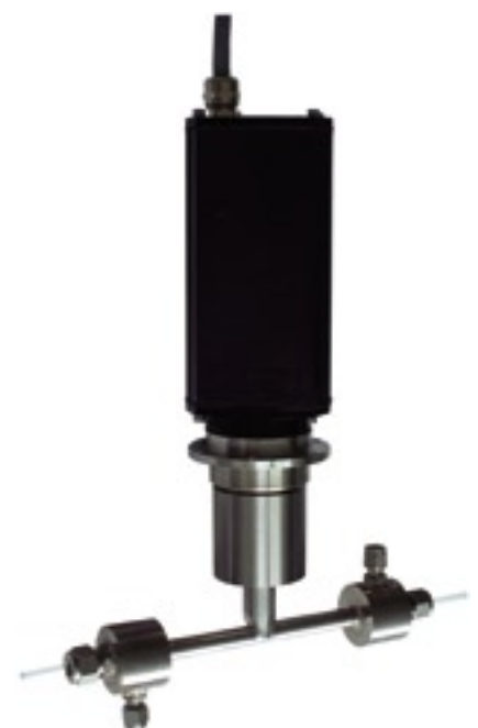
UIP250H56 with mini flow cell Dmini

For our ultrasonic processor we offer flow cells made of glass or stainless steel. The liquid to be sonicated is lead in from below and passes through the cavitation zone under the sonotrode. The appropriate sonotrodes are equipped with O-rings, that are fitted closely to the cell wall or the PTFE-adapter. For higher pressures and temperatures the sonotrodes may be equipped with metallic oscillating-free flanges that are mounted to the stainless steel flow cells. The selected flow rate corresponds to the energy input required. The temperature of the medium can be influenced by means of a cooling jacket. Special designs of the flow cell e.g. several supply connectors, when emulsifying are manufactured according to the demands of the customer. A new product in our product range is the mini flow cell (patent pending). When using this mini cell, the medium is hermetically sealed, so that the sonication can be realized without contamination.