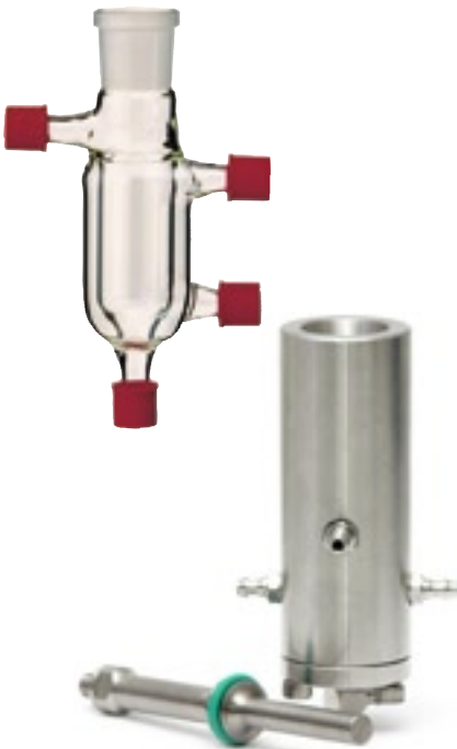
flow cells GD7K and D7K

The ultrasonic processor UP100H (100 watts, 30kHz) has the same dimensions as the UP50H but it is suited for the double power output. With the use of the 10mm sonotrode the field of applications expands to applications with volumes of up to 500ml. All other features and standard equipment are equal to those of the ultrasonic processor UP50H.