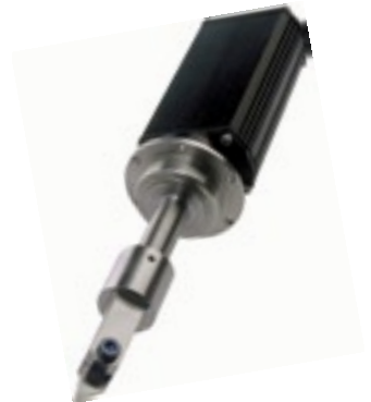
cutting and welding