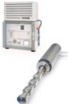
ultrasonic industry processors