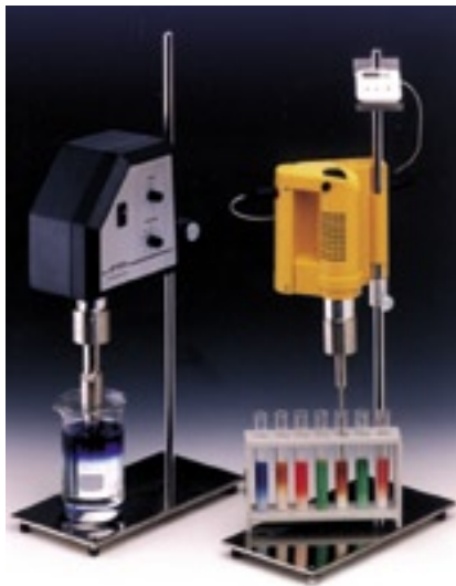
UP400S and UP200H with timer

As desk-space in the laboratory is expensive we supply ultrasonic processors in a compact design: Power supply, generator, control and transducer, all of which are located in an aesthetic housing. No additional cables impede.