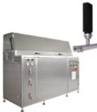
wire-, tape- and profile cleaning