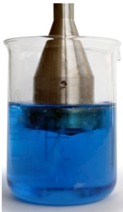
cavitation at S40

The ultrasonic processor UP200S (200 watts, 24kHz) differs from the UP200H only with its shape and its use only with stand.