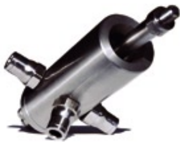
stainless steel flow cell D7K with MS7D