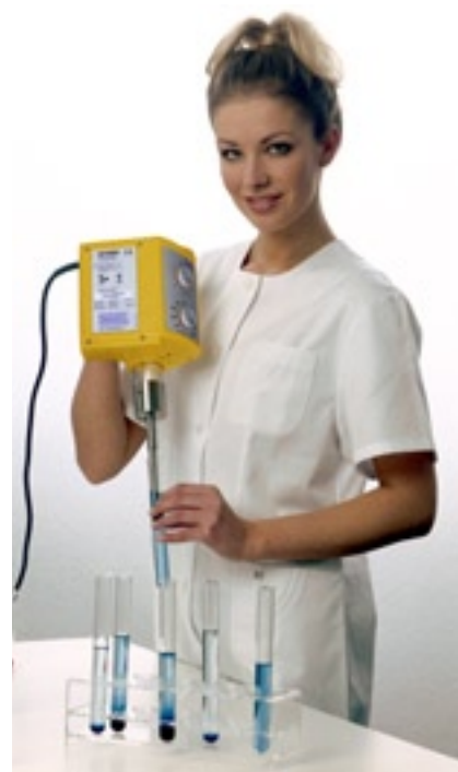
UP200H with S7

We offer a comprehensive range of accessories for the UP200H such as flow cells, stand, sound protection box, timer and PC- control.