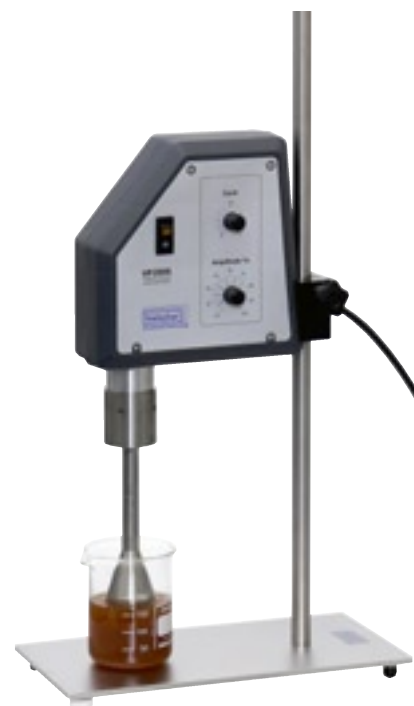
UP200S with S40

As all our laboratory devices the UP200S finds its customers worldwide. Without any additional fees we supply our devices with the adequate supply voltage (100 to 110V) and with the corresponding plugs.