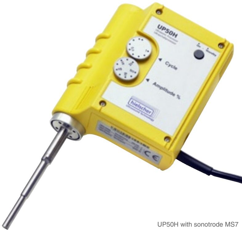
UP50H with sonotrode MS7

The ultrasonic processor UP50H (50 watts, 30kHz) is the smallest model of our aesthetic laboratory devices, that are only supplied by Hielscher Ultrasonics in that compact form.