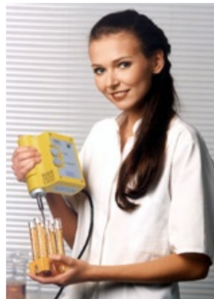
UP100H with MS7

For continuous operation only a flow cell and the appropriate 7mm sonotrode is required. Continuous processes in the smallest scale can be simulated. The optional PC-control may be helpful, if a test record is necessary or to optimize processes.