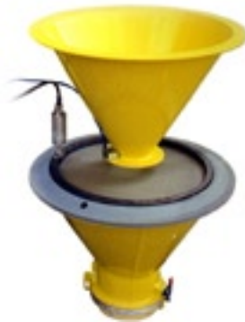
industrial ultrasonic sieving